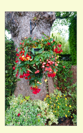
The War Memorial