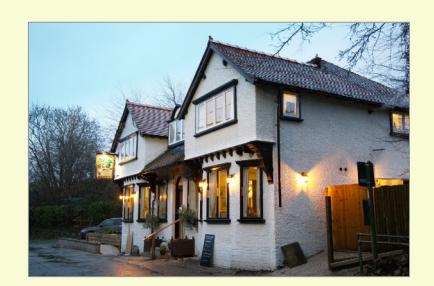
The Bird in Hand is open Wednesdays - Sundays