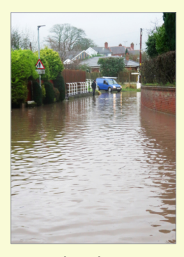
Floods in January