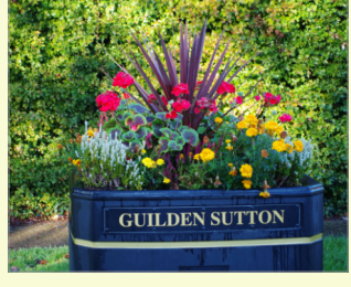
Floral welcome to Guilden Sutton